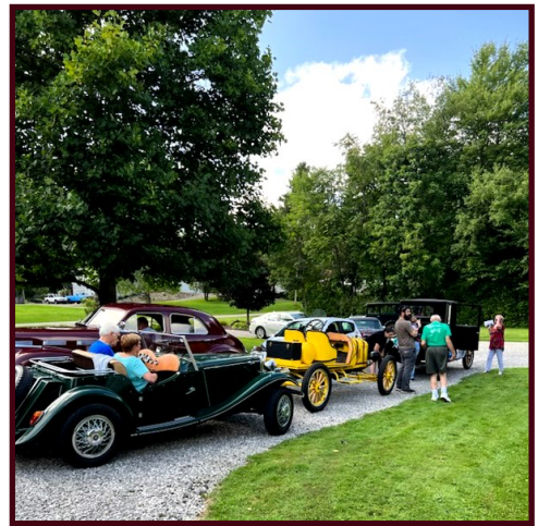
MEANDER CHAPTER - Cars on Tour!