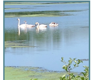
Swan Family on Muskingham Watershed