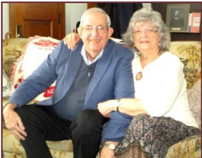
Celebrating 50 years of marriage!