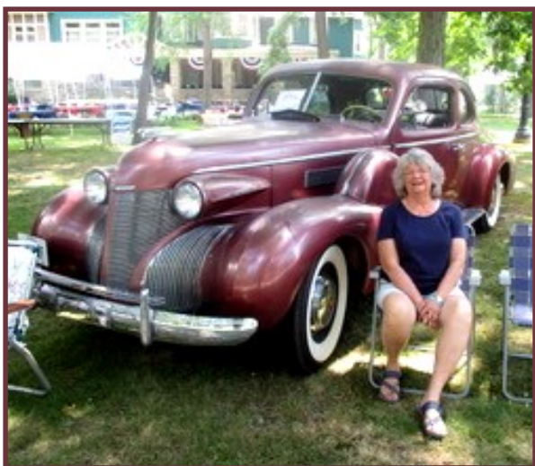
BOTTOM RIGHT: 1964 Impala