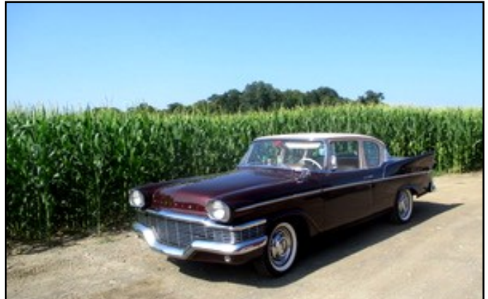
Cars on Summer Tour

Sue Westhafer showing off her haul on the raffle baskets!