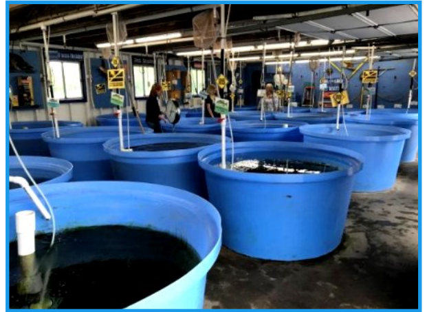
SOUTHERN CHAPTER - LEFT - Dayton Dragons game RIGHT - Jones Fish Hatchery