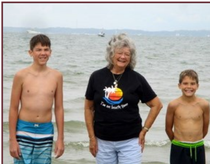
Sharing time with grandsons at the cottage.